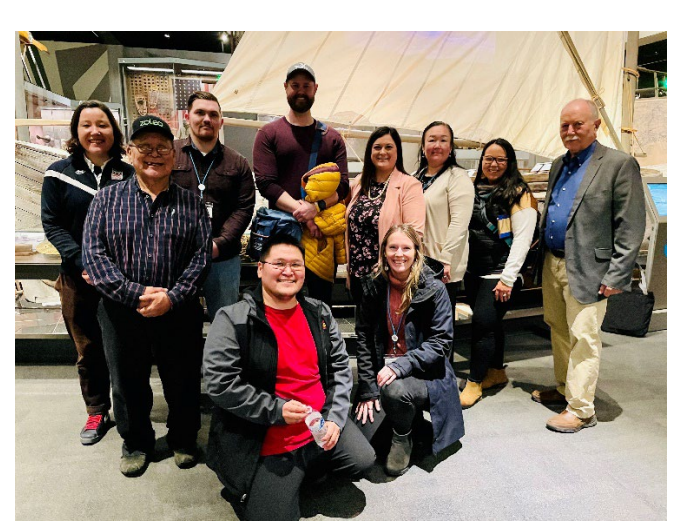
January 18: Bristol Bay UAF Legislative Process Class