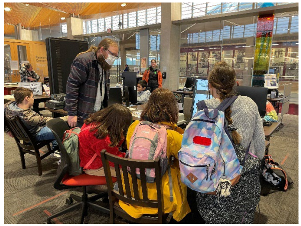
December 14: Dzantik'i Heeni Middle School